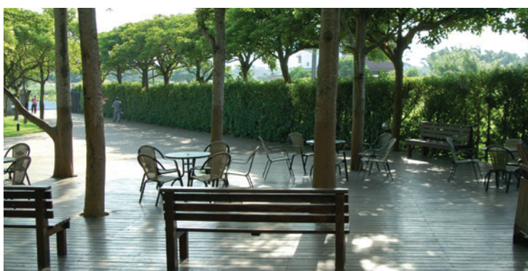
Hong-Shi Buddhist College