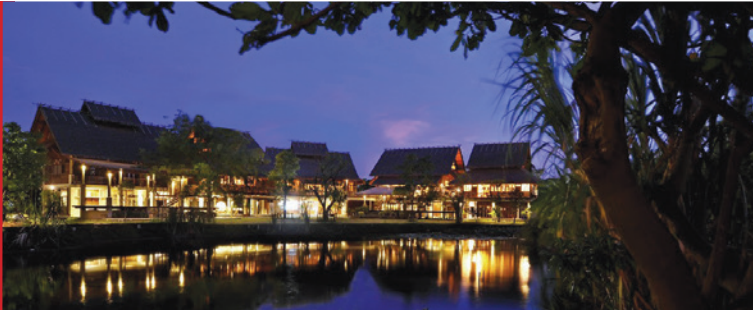
Arsom Silp Institute of the Arts, Bangkok