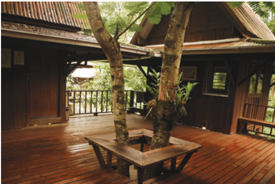
Wongsanit Ashram, Nakhon Nayok