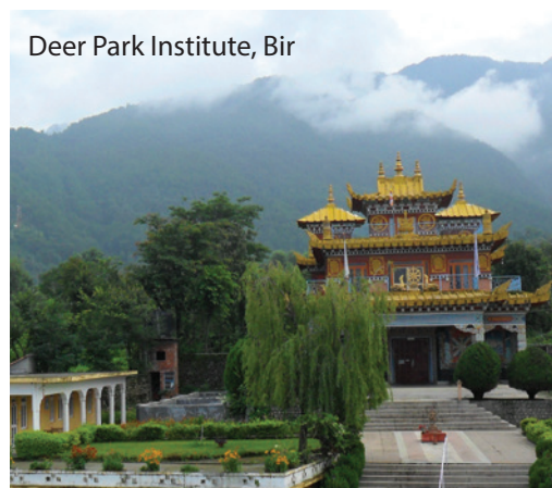
Deer Park Institute, Bir