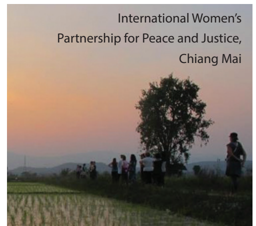
International Women's Partnership for Peace and Justice, Chiang Mai